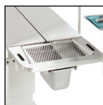
Dental Head Rest Rigid, large surface. Fast drainage. Stainless steel.

The Olympic Dental Table will hold your present and future equipment. Accessories fit into drop-in sockets and can be quickly moved or changed.