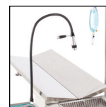
Procedure Light on Swing Arm. LED, bright, cool. Flexible gooseneck.