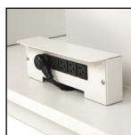
Electric Outlets 4 outlets in protective enclosure.