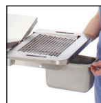
Drain Pan Under head rest. Slides out easily for cleaning.