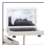
Laptop Tray on Swing Arm holds your laptop securely.