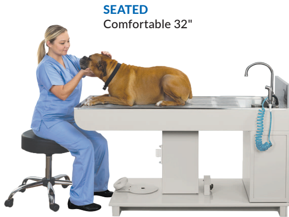
SEATED Comfortable 32"