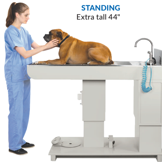
STANDING Extra tall 44"