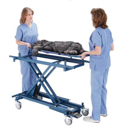
Lift the stretcher, not the patient Safer. Helps prevent injuries. Perfect for transfers from the back of vehicles.