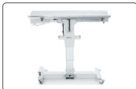
Expanded Height Range 29"-49"

The sleek styling of this table is designed to facilitate easier movement around the table and reduce cleaning time between procedures.