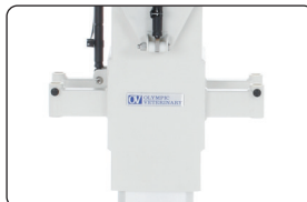
2 Column-Mounted Sockets