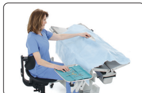
275 lb Patient Weight Capacity