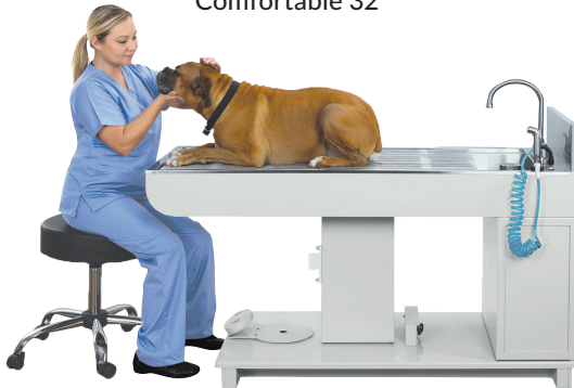
SEATED Comfortable 32"